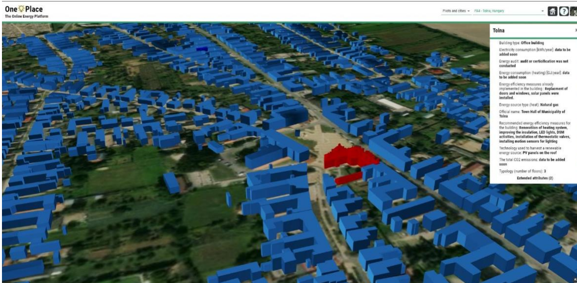
Example of Pilot Action in OnePlace.